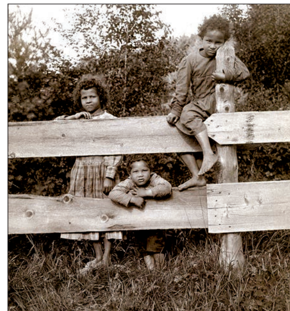
Fig. 2 - Children, Bristol, VT, 1892.

Not infrequently, white Americans, including