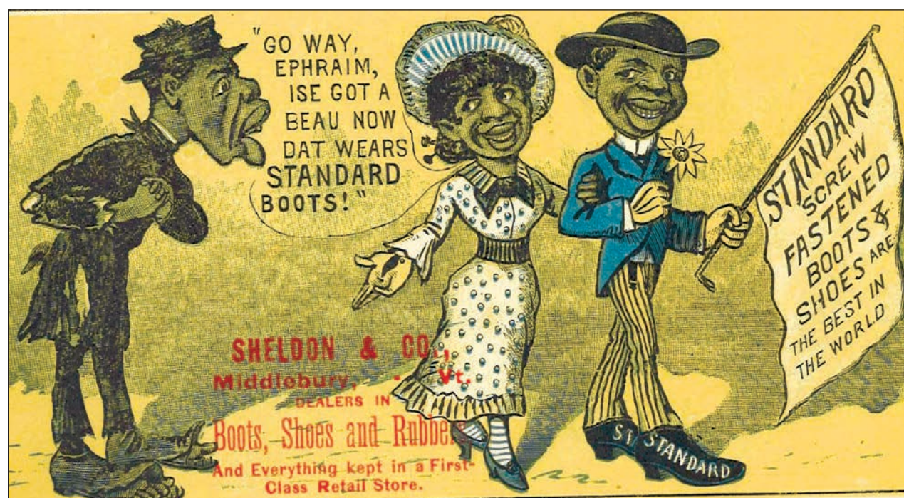
Fig. 1 - Advertising Card, ca. 1880.

Middlebury cemetery records provide another enticing yet tacit glimpse into the local presence