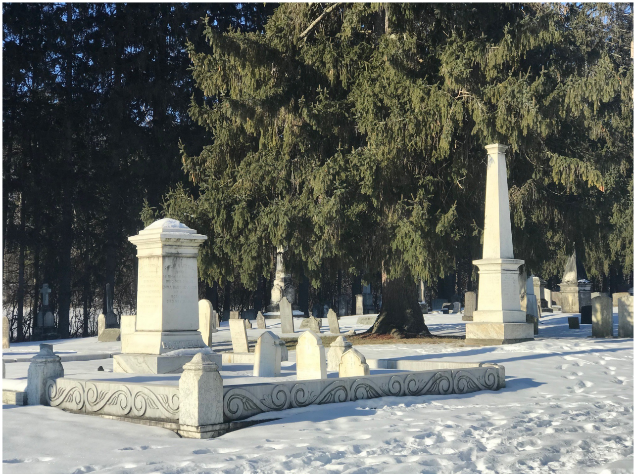
Fig. 4 - West Cemetery, Slade Family obelisk on the right.